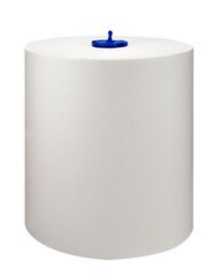
Tork Washstation Paper white 1 ply W6 130007