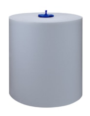
Tork Washstation Paper blue 1 ply W6 130008