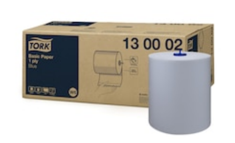
Tork Basic Paper blue 1 ply W6 130002