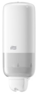
Tork Liquid and Spray Soap Dispenser Wh 560000