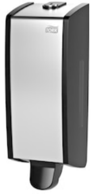
Tork Liquid Soap Dispenser Alu 452000