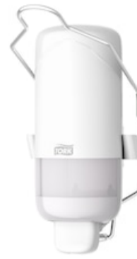
Tork liquid soap disp w bracket, White 560101